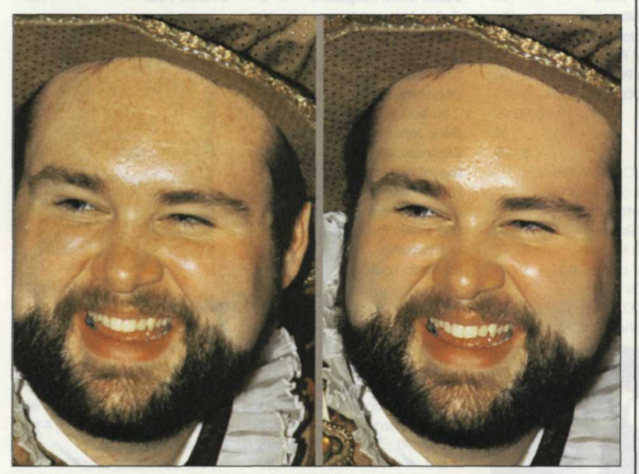
Before (left) and after (right) images of the Kodak Digital Gem Airbrush filter in use.

amazed at the speed with which they can now edit portraits with this plug-in. The versatility and fine line control make it easy to remove unwanted blemishes while still maintaining eyes and intricate eyelash detail. We both give this plug-in a big thumbs up as this filter is definitely a keeper.