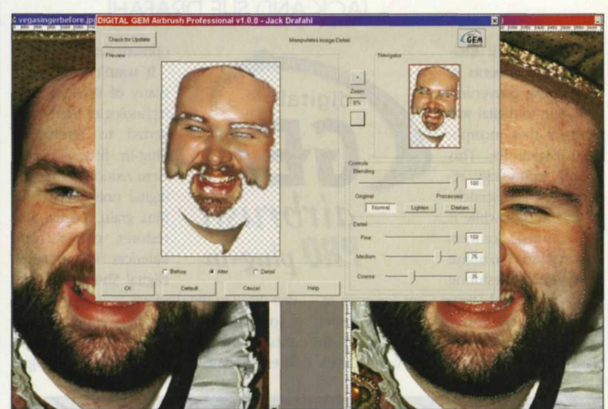
Before and after image of the Kodak Digital Gem filter in use. Foreground shows the Digital Gem menu. Notice that only the areas selected with the Adobe Photoshop Color Range filter are displayed in the menu and affected by the filter.

pher even more control and better image enhancement. The Digital Roc Pro adds contrast and brightness control as well as supporting 16-bit color images. Digital Sho Pro expands to reveal hidden detail in the highlight as well as the shadows. Digital Gem Pro adds more powerful grain and noise reduction features as well as 16-bit support.